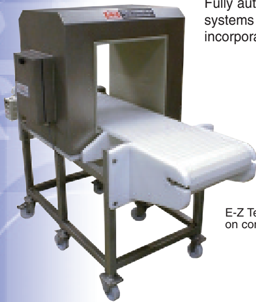
E-Z Tec 9000 R on conveyor

Fully automated reject systems can also be incorporated.