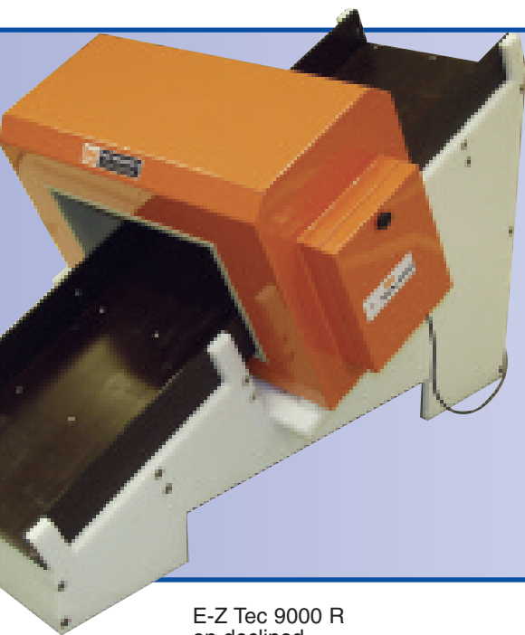
E-Z Tec 9000 R on declined chute

Notes: Larger aperture models will be available in the future. For throughput data, please consult our sales office.