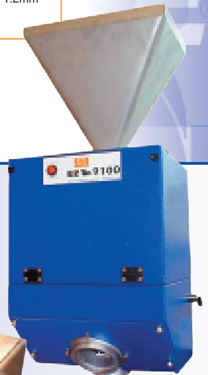
E-Z Tec 9100