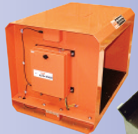
E-Z Tec 9000 RD