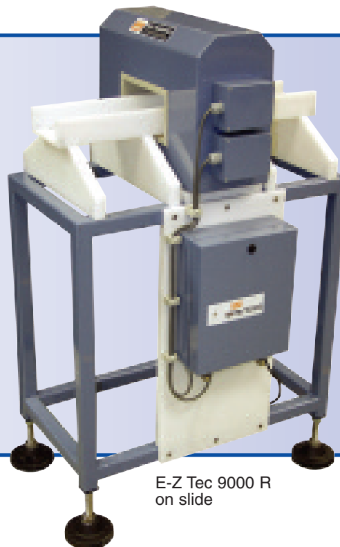
E-Z Tec 9000 R on slide