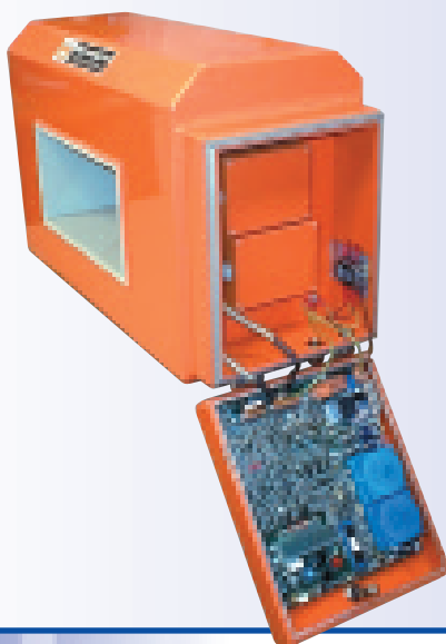
E-Z Tec 9000 R

Detection sensitivities of these models are dependant upon the aperture dimensions and are available on request.